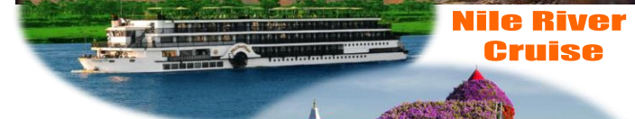
Nile River Cruise