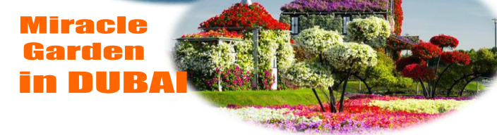
Miracle Garden in DUBAI

Amman, Petra, Tiberias, Nazareth, Sea of Galilee, Cana, Capernaum, Haifa, Mount Carmel, Jaffa, Jerusalem, Bethlehem, Dead Sea, St. Catherine, Mount Sinai, Giza, Cairo Extension: Nile Cruise & Extension: DUBAI